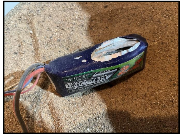
This battery almost created a fire

Another part of battery safety is knowing when to retire a particular battery. We all know how expensive our batteries can be, so we keep them around as long as we can. Unfortunately, in the case of high-power concentration LiPos and others, overusing them can lead to dangerous failure and combustion. I came really close to experiencing this one time when I tried to charge a puffed LiPo. I was fortunate to check in on the battery and unplug it immediately and let it cool down. The next photo shows that the heat had melted the outer wrapping and one of the cells split open, exposing the chemicals inside. Any longer on the charger and I'm sure I would have had a fire in my basement. Keep this in mind: no old puffed battery is worth the risk of causing a fire in your house or garage.