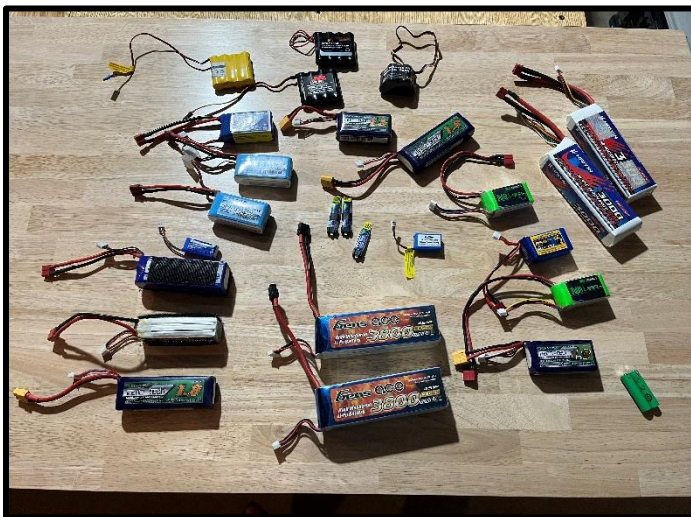
An assortment of NiMH and LiPo batteries

works for you and the type of batteries you keep. The batteries we use in our airplanes come in different chemistries, sizes and voltages. The photo below shows a pile of batteries that I've collected over the years. The problem with these particular ones is that I don't use them anymore. They all are many years old and some don't hold an adequate charge for flying a plane or powering a receiver. Most of them should probably be recycled at this point. Keep in mind, you should not simply throw them away in the trash. Batteries disposed of this way can start fires and put waste collection personnel in danger. My preferred way to dispose of them is to take them to Batteries Plus, because they told me they will take any battery in most any condition to be recycled.