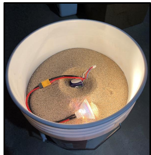
One way of discharging a spent battery

In my opinion it is best to discharge a battery before taking it in for recycling. I take care of this by hooking the battery up to a 12 VDC light that you can get from the hardware store. I soldered wires onto the pins, added shrink tubing and a common connector and place the contraption into a 5-gallon bucket of sand. This should contain any fire that might occur as you bring the voltage down to zero.