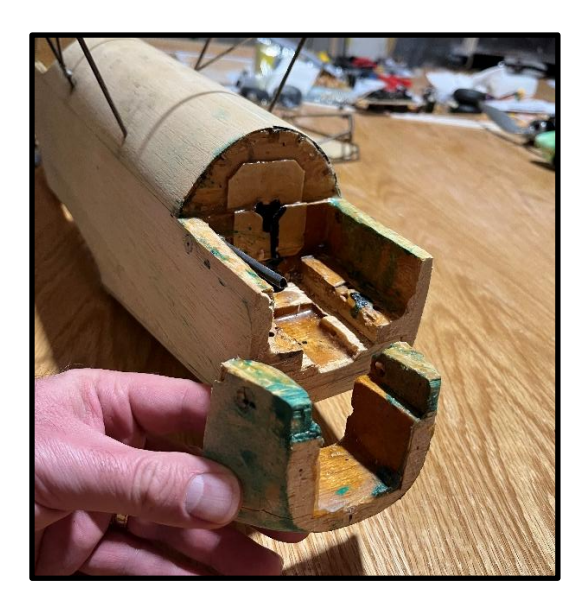
The 1.5" hunk of balsa removed from the nose

Now I was all set to get to work on repairing the broken parts and changing a few details to suit my preferences. This included removing the torque rods in favor of a servo on each aileron, shortening the nose back to the original length, and revising the wing mounting methods.