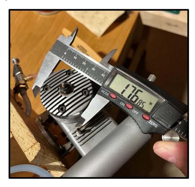
14 cooling fins and 1.77" diameter

number of cooling fins and diameter of the engine head with what was listed. The strange thing was that it appeared to be larger than my OS 50 I have for another project, so I hadn't been aware of the difference.