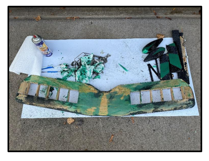
My attempt at stripping the upper wing

Some of you may know about the Aeromaster biplane that I acquired a while ago for the hard-to-pass price of $20. It was built decently well by its previous owner, but the Silkspan covering was already torn in a few places despite having never flown, and the paint was thick and runny. I was encouraged by another club member to put it higher on my list of planes to get to, so I spent some time removing the covering where I could. I tried to use paint stripper on the rest, but I'm not sure I was patient enough to let it work.