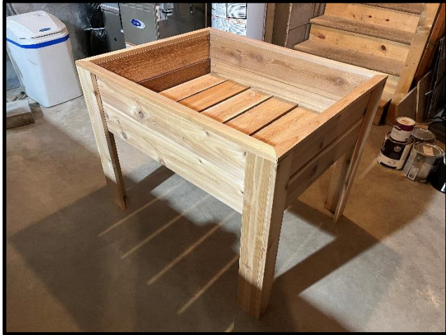
The finished planter

especially since she was just going to fill it with dirt. I feel blessed to have a spouse who will participate in some projects like this around the house and yard and I'm taking this moment to mention how much I appreciate her.