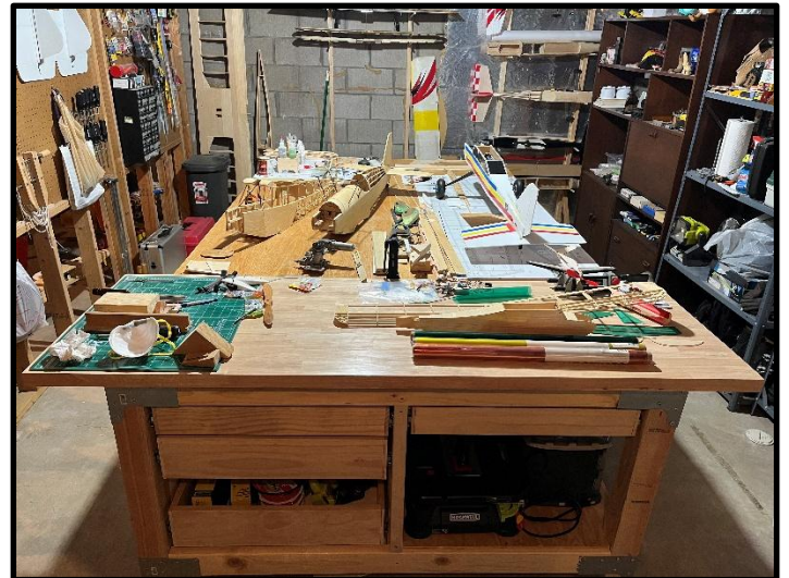
My always busy workbench

You may ask why I would put an old, heavy electric motor in my Cub, and I would answer that the model probably needs the nose weight anyhow. Plus, I would prefer that she flies more scale-like without throttling too far back. Finally, there was nothing wrong with these old motors. The limitations were in the batteries of the time. Today, I can hook it up to a 5 cell LiPo and obtain much longer flight times out of the setup.