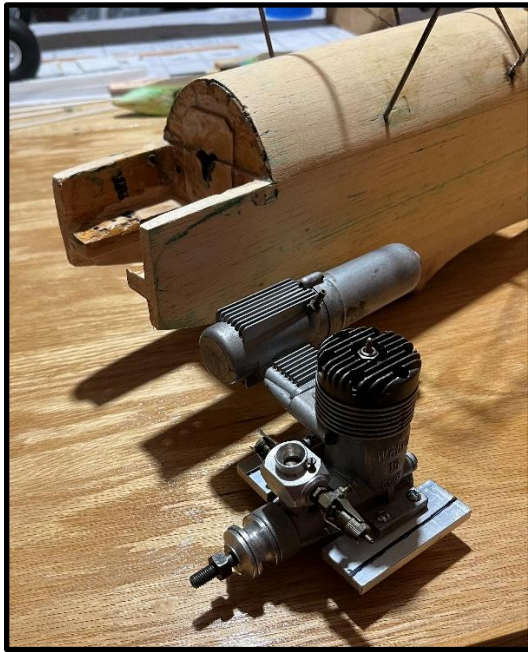
Aluminum engine mounts

and engineering department has a machine shop, where I can spend some time using the tools that I don't already have.