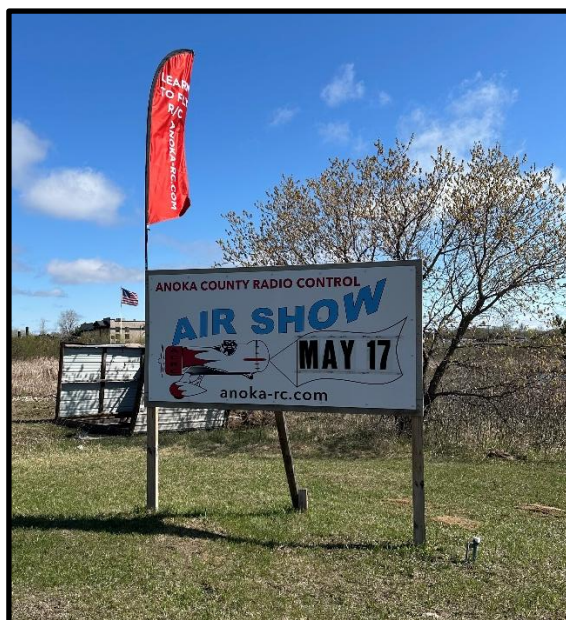
New Training Flag is Up