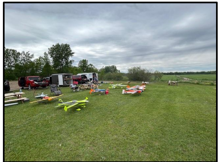
That's a lot of aerobatics in one place