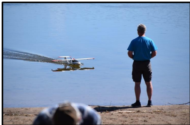
Returning to shore at the Float Fly

I think it is safe to say we had a full season of successful events this year. Thank you to everyone who contributed to them, whether by organizing the event, bringing food and helping to serve for lunch, and for showing up to participate in a safe and friendly manner. I look forward to what we can accomplish next season.