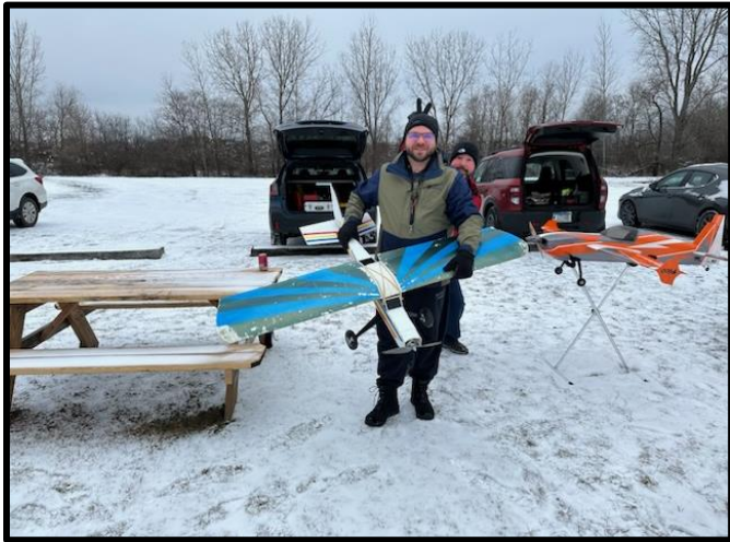
Freeze Fly photo-bomb

We had a great season of events this year! I figured I'd fill this page with some of the pictures that were taken. For those who are not aware, you can also find these and more photos on the ACRC Photo Album.