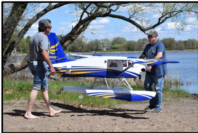
Carrying a plane to water at the Float Fly