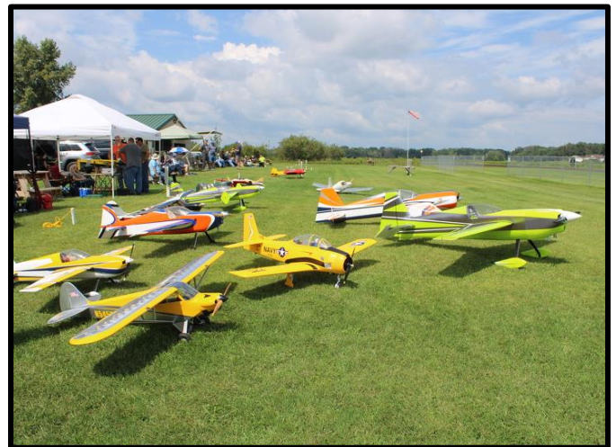
Lots of planes and spectators at the Big Bird Fly In