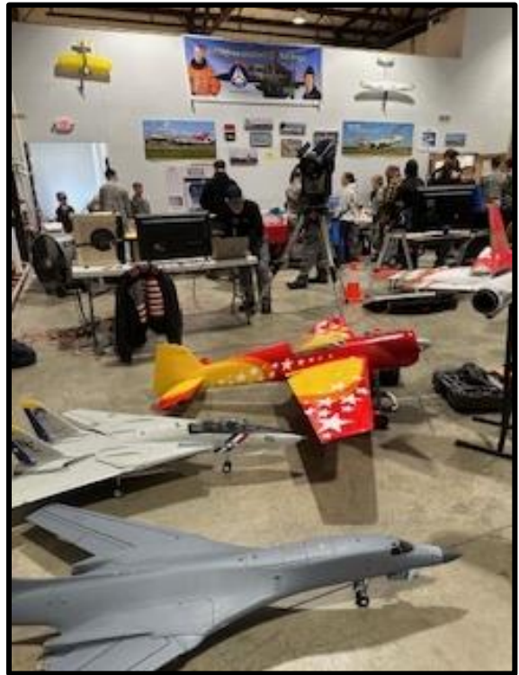
Planes on display at the CAP Aerospace Fling