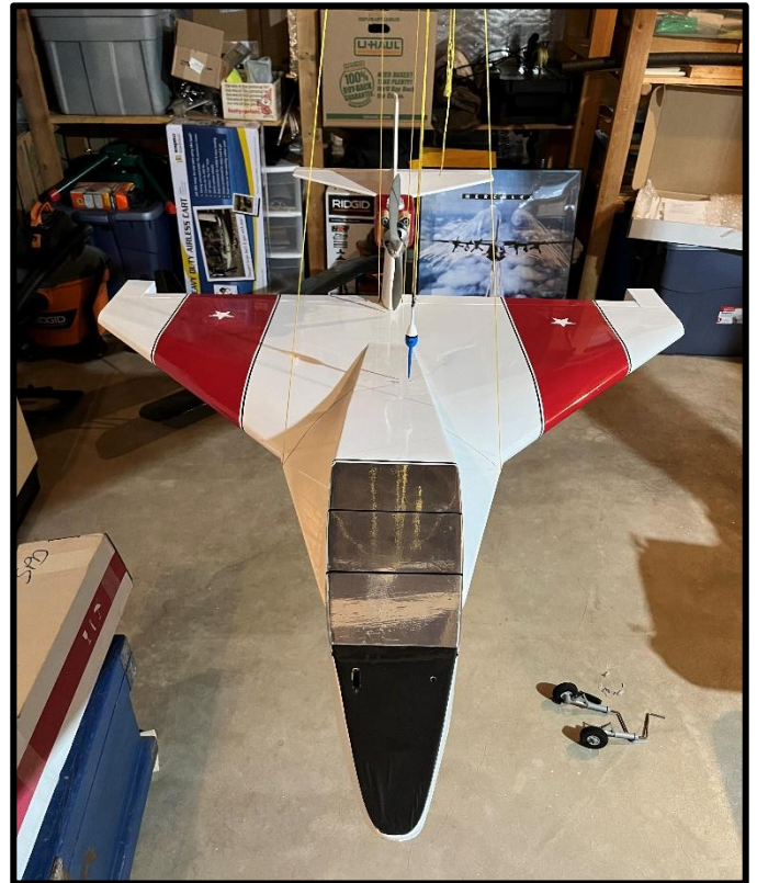
Using a Vanessa Rig to balance the Northstar

You can see that my Stinson takes up a whole corner of the basement with its wings on. I have no intentions of storing planes in my garage or attic, so I'm left with the decision to not acquire any more planes. Hopefully this will let me focus on the projects I already have and learn to be content. I think I've discovered over the course of this rambling article that it is important to not overwhelm myself with high expectations and to set limits on buying planes before it's too late. In my case it may already be too late because the stack of kits I have will inevitably expand to take up more space when I get around to building them. For now I plan to simply enjoy the building journey and be happy with what I already have.