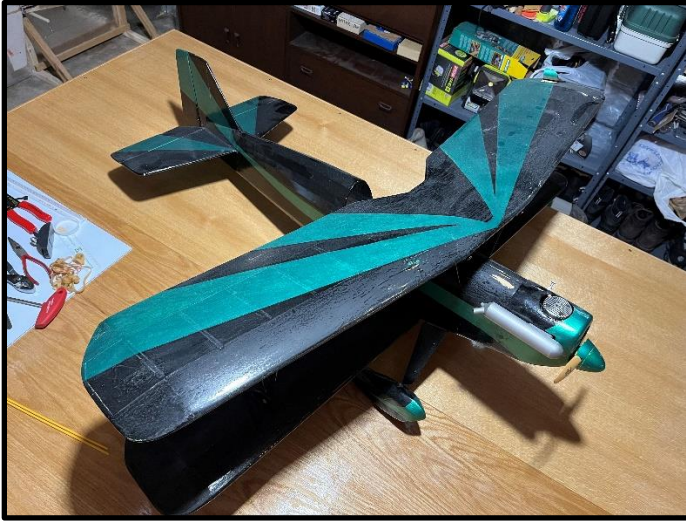
Aeromaster in need of some refurbishing

I'm prone to getting frustrated over my supposed inability to finish projects, but I know now that negativity like that is not productive or healthy for me. So, this year I'm trying something different and not committing to any particular prediction of what I'd like to complete. I'd rather commit to enjoying this hobby that we love and stop focusing on the end goal of finishing (and by the looks of my basement I doubt I'll be at the point of "finished" for decades anyhow).