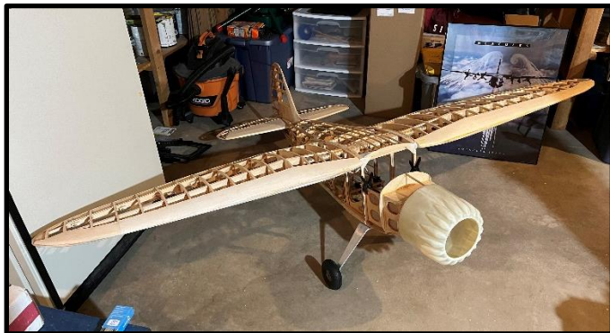
Stinson Reliant in the bones

I would estimate that I have somewhere around 40 airplanes in various stages of completion, from kits to almost ready to cover and some just needing a bit of TLC. The fact that only half-a-dozen or so of those are flyable means that I have a lot of work ahead of me. It would serve me well to stop adding to the collection and be satisfied with what I have. The difficult part is that I have a soft spot for planes that need a new home, but my shop is currently bursting at the seams.