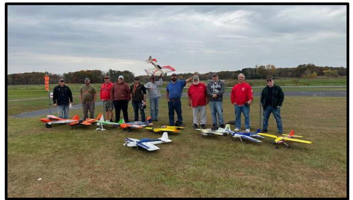
The Fun Fly Participants (and their pilots)