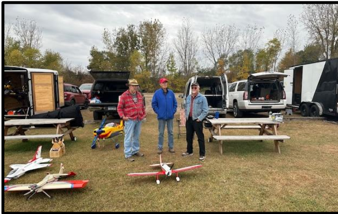
Part of the Fall Fly-Out crowd

At the flyout I got to see some faces that I hadn't seen all year and a couple that I hadn't seen for several years.