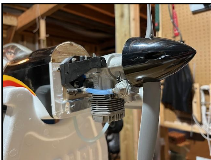
The new engine location

As I mentioned earlier the engine had to be moved forward to match the plans. This primarily helped in balancing the airframe, as it was quite tail heavy without having the full length to the nose.