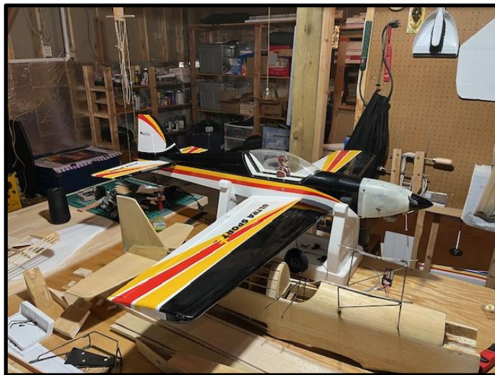
The Ultra Sport 40+ is getting close!

I also had to acquire a new cowl since the original was too short. In order to get the CG correct, I even have to mount the new LiFe battery above the engine under the cowl, plus a few ounces of lead and a Higley heavy hub hidden under the spinner. Phew!